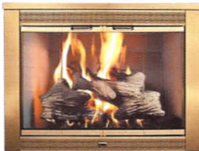
Shown in Antique Finish

The Regal is a brass plated enclosure with 3" side panels, 1 1/4" top cap, 3" top and bottom panels (filigree), and a center draft control.