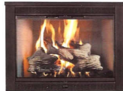
Shown in Black Finish

The Regal is a brass plated enclosure with 3" side panels, 1 1/4" top cap, 3" top and bottom panels (filigree), and a center draft control.