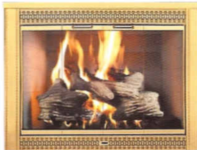
Shown in Polished Brass Finish

The Original is a solid brass enclosure with 3" side panels, 1 1/4" top cap, 3" top and bottom panels (filigree), and a center draft control.